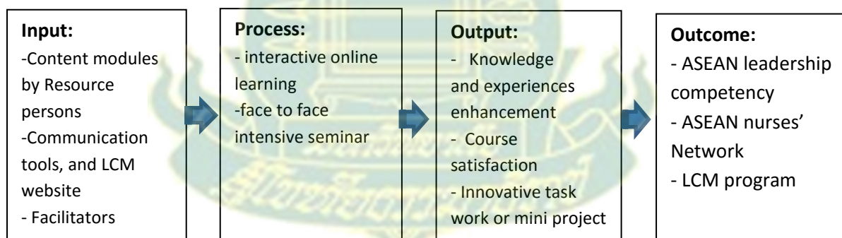
Figure 3 The components of LCM online course

The LCM online course consisted of four components: input, process, output and outcome as shown in Figure 3.